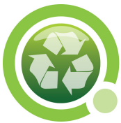
Waste Reduction (Reduce, Reuse, Recycle)

Think about surveying those interested on where their intrigue lies. See Appendix B for a sample survey. Topics could include: