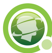
Informing & Engaging Others