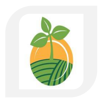
PLANNED GROWTH VANCE CORUM