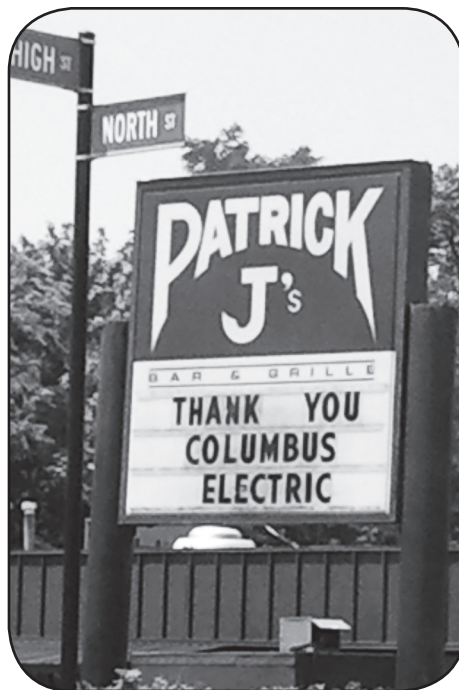
A customer thanks DOP, summer 2012

• Be aware of the risks of switching to a third party electricity supplier. You must change your electric company in order to use a third party provider, there may be charges, and you will lose the reliability and service of Columbus Power. Offers may not include all costs and may be short term. Carefully consider the contract terms. Is the price fixed or variable? What charges will be included on your bill? Your new electricity bill may be more complex with many "add-ons." Early termination fees may also apply. Another important consideration is the volatile electricity market. The market can experience many swings in power prices. Most consumers do not follow these markets and other offers you receive may be for a relatively short time. After the promotional offer ends, you could be subject to higher prices or be required to obtain a new and less attractive agreement.