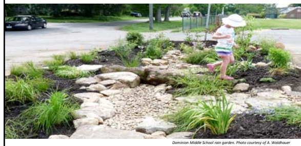
Dominion Middle School rain garden.