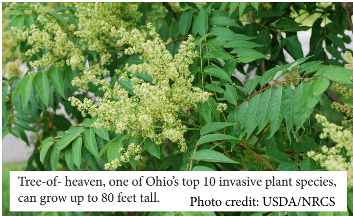
Tree-of-heaven, one of Ohio's top 10 invasive plant species, can grow up to 80 feet tall.

Many invasives like bush honeysuckle, were once sold in garden centers and planted throughout Ohio. Wind and wildlife spread seeds from neighboring infested areas. Once an invasive plant takes root, its aggressive growth can quickly make it the dominant species.