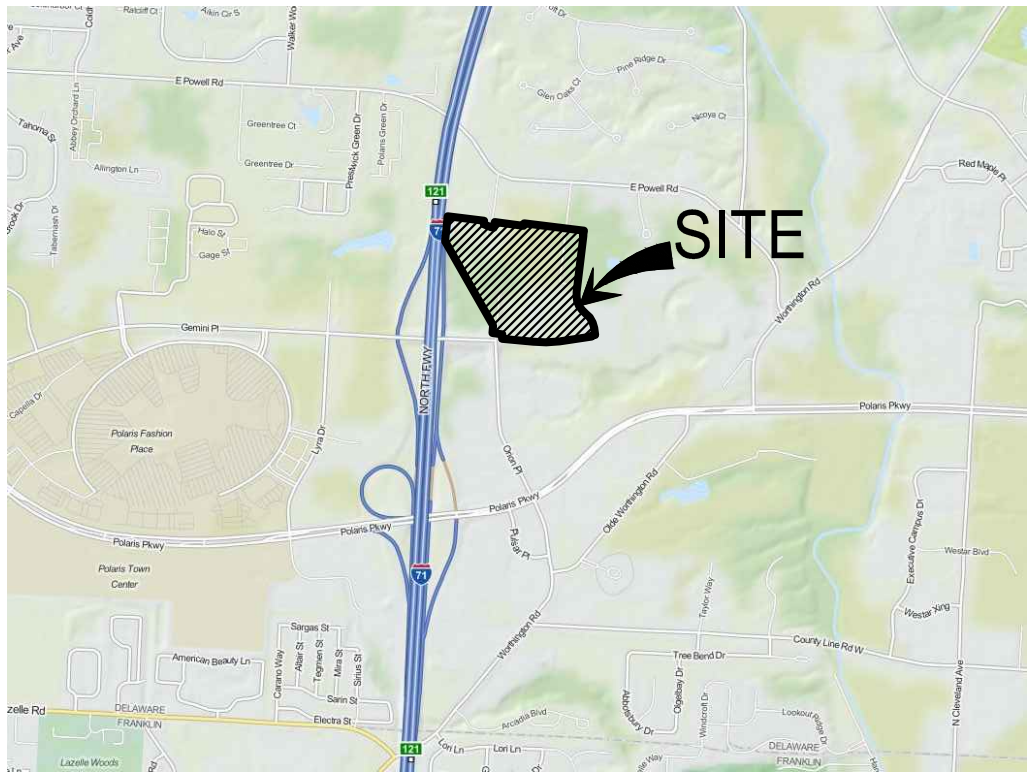
LOCATION MAP (NTS)