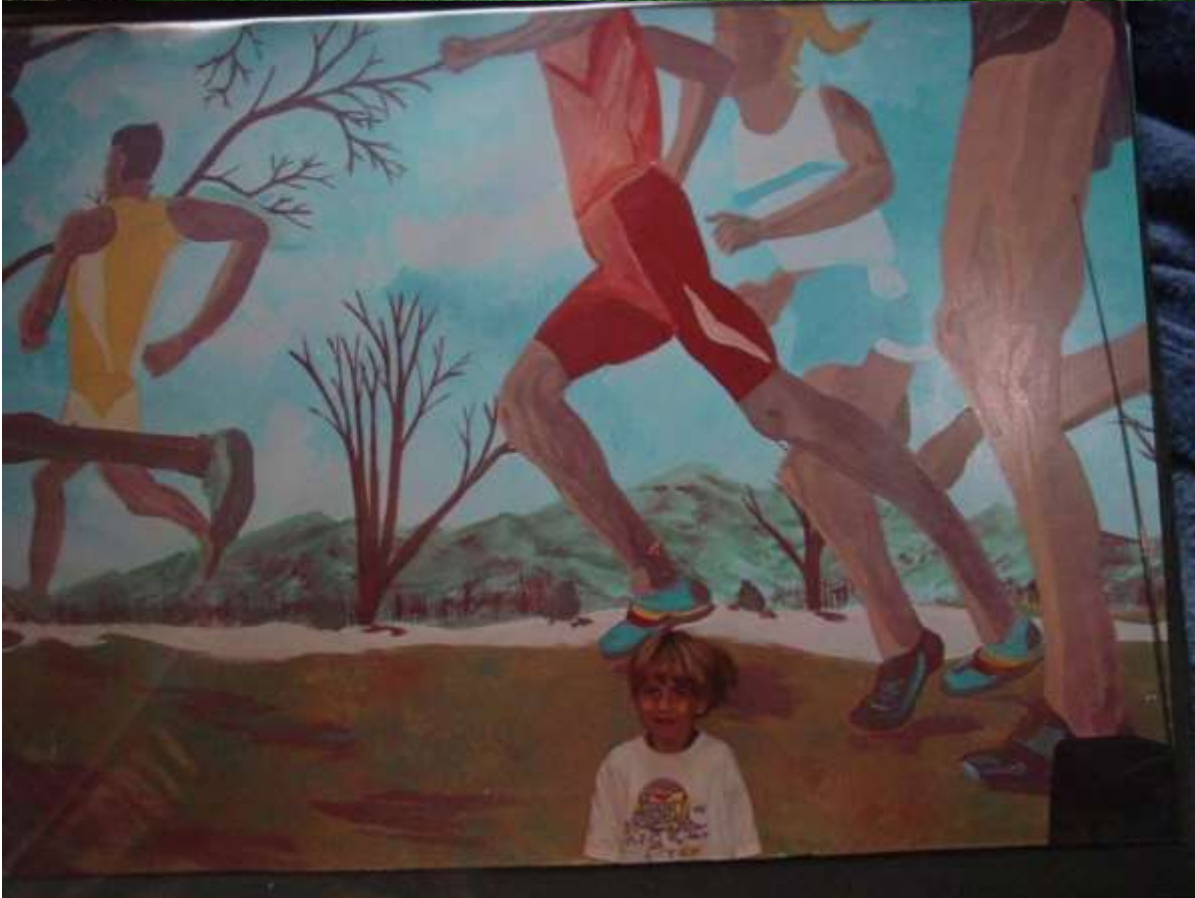
Marathoners in a family room 10x10