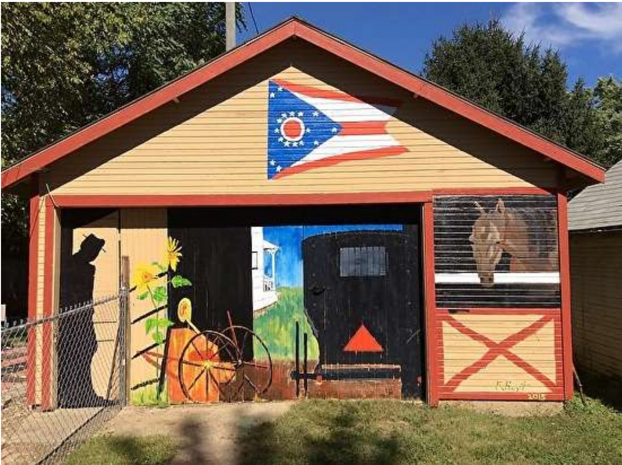
Most recent work Sept 2015. Everything is done freehand. 20' x 8' was done in 2 afternoons.