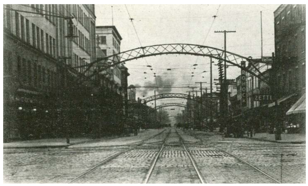
The electric arches in the "Hub District" on the corner of Fourth and Main Street sometime between 1901 and 1910.