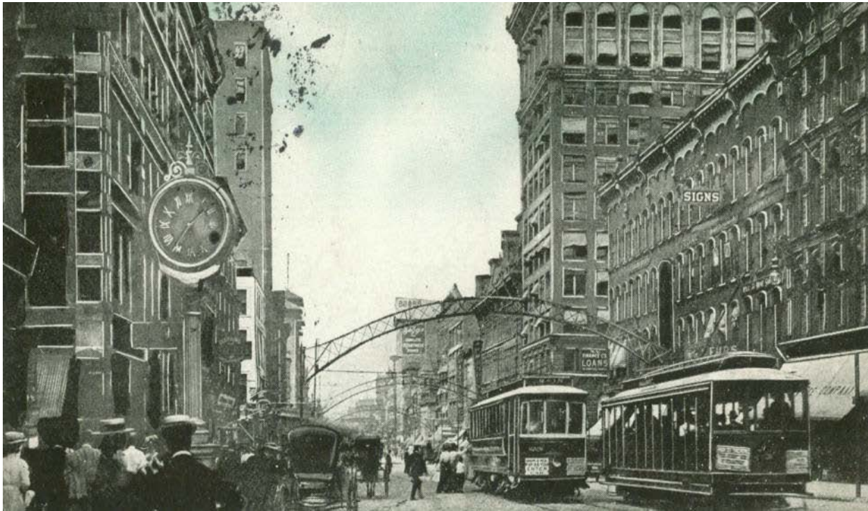
Black and white postcard of North High Street in 1913, published by the Novelty Shop. The postcard features the Atlas Building on the right.