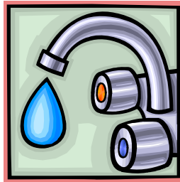
1/16 inch Flow

6,000 GALLONS PER MONTH $57.11 Per Month