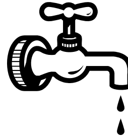
1/8 inch Flow

23,333 GALLONS PER MONTH $222.10 Per Month