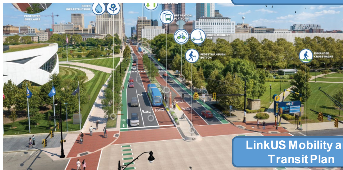
LinkUS Mobility and Transit Plan