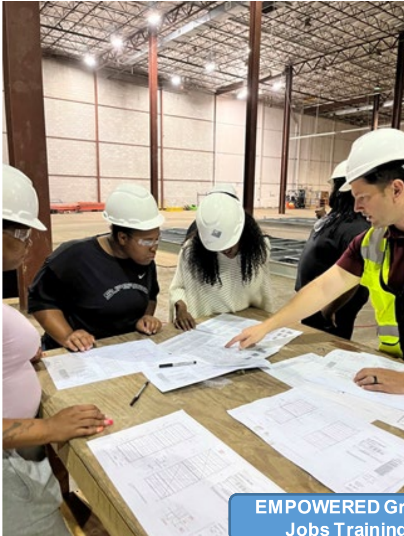
EMPOWERED Green Jobs Training