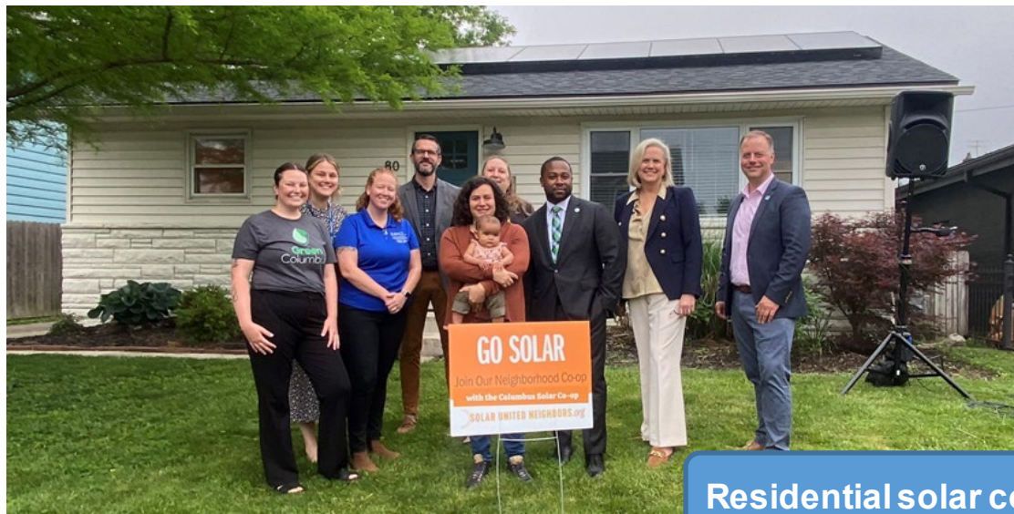
Residential solar co-ops