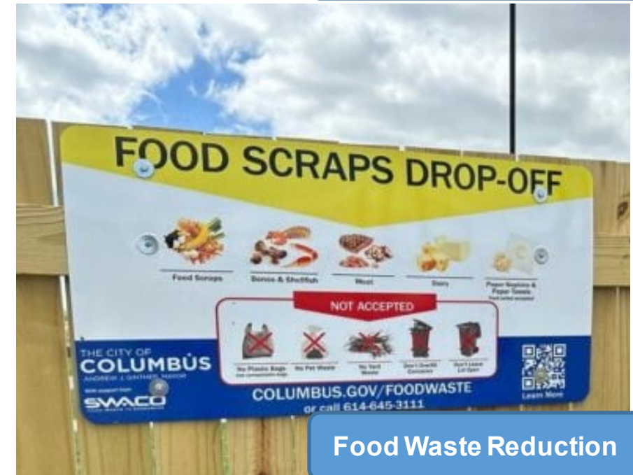
Food Waste Reduction