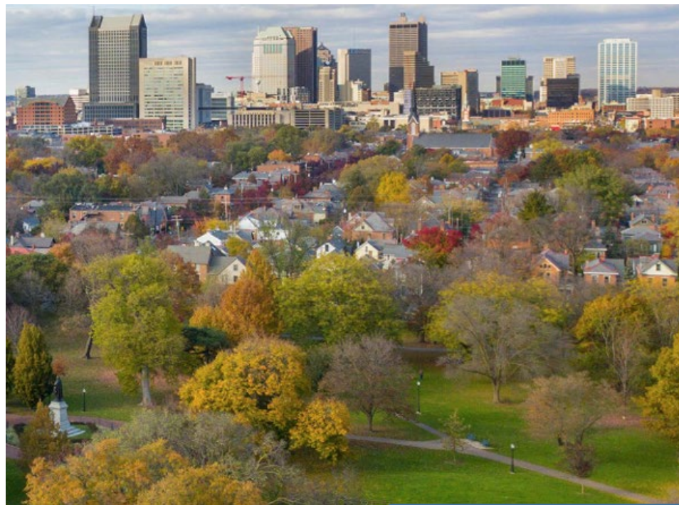
Urban Forestry Master Plan