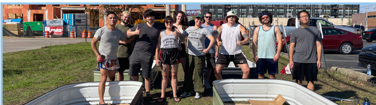
The Nak Muay Naturalists install planter boxes in a new community garden.