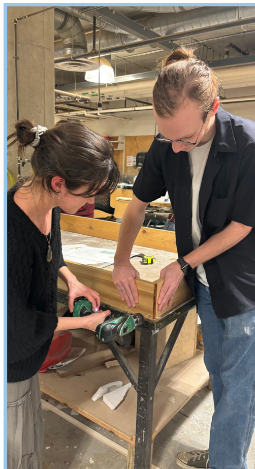
Members of the Knowlton Conservation Corps build planter boxes for a rooftop native plants garden and for a local elementary school.

Be creative! As youth leaders, we’re looking to you for new ideas for the future!