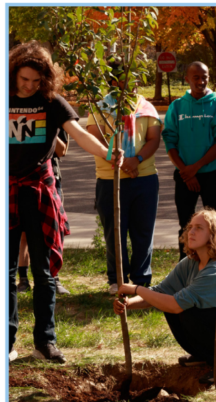
Members of Columbus State Community College's Sustainability Group plant native trees on campus.