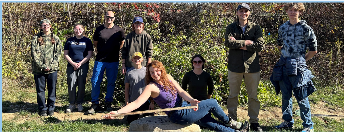
Members of the Society for Ecological Restoration at OSU and other project partners celebrate after a day of invasive plant removal.

Visit the Youth Climate Action Fund to download an application. Submit by June 30, 2025 to make sure funds are still available!