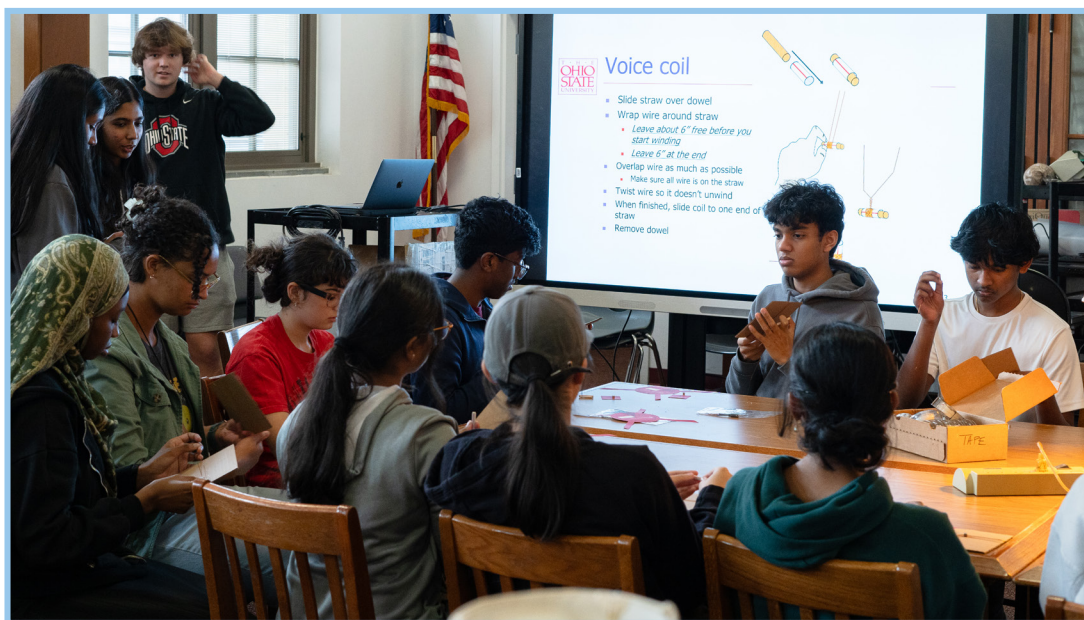
Student group OHI/O develops and leads a climate hackathon for high school students

Ineligible project expenses include projects already ongoing; services covered by existing city initiatives; speaker honorariums and speaker fees; indirect costs like rent or utilities; nonprofit incorporation fees; scholarships; direct support to individuals or families; partisan political organizations, candidates, fundraisers, or projects; legislative advocacy or lobbying activities; capital campaigns, endowments, or endowed chairs.