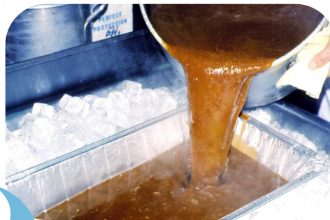
3 Digsi Godon