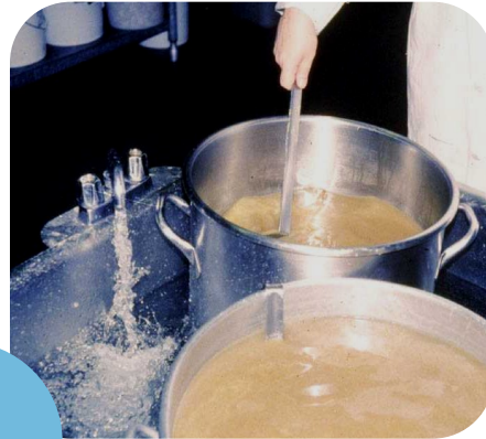
1 Baraf Dhex-dhig