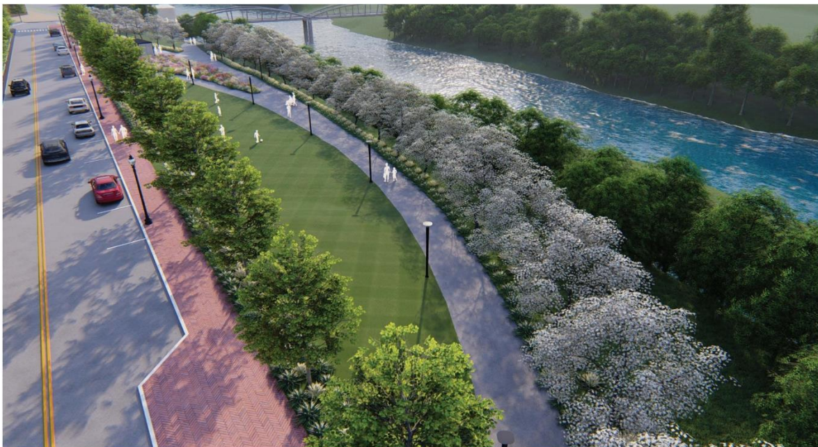
Overall Looking South