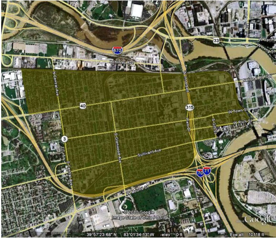
Franklinton Area of Greatest Need