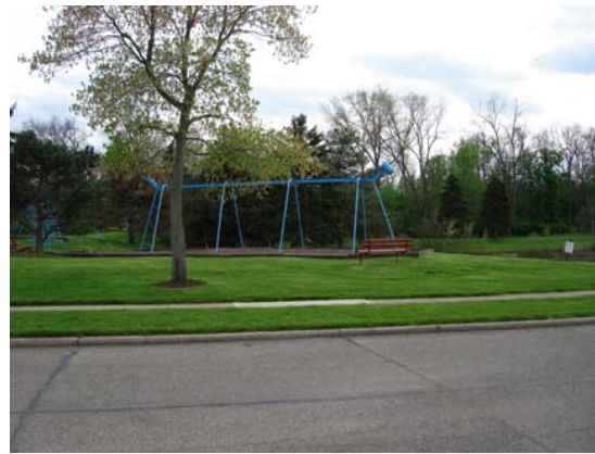
Many playgrounds serving residential apartment complexes in the Broadmeadows area West of High Street