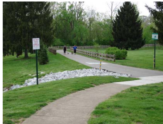
Olentanty Trail and Antrim Park connections from Rush Run Park