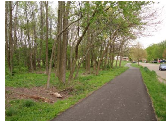
The new Sharon Meadows Park features a one mile walking path, recreation fields, and a natural area with community-planted trees

Comments: The new Sharon Meadows Park is a celebrated addition to the community. The resident on the walk shared that prior to the parks completion – the area surrounding the vacant school lot that became the park was experiencing a concentration of foreclosed homes. Since completion of the park – home vacancies have decreased around the park.