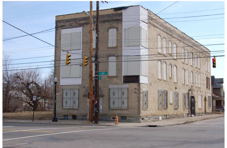
905 E. Long Street "The Charles"

City of Columbus Department of Development Land Redevelopment Office 109 N. Front Street Columbus, OH 43215 (614) 645-5263