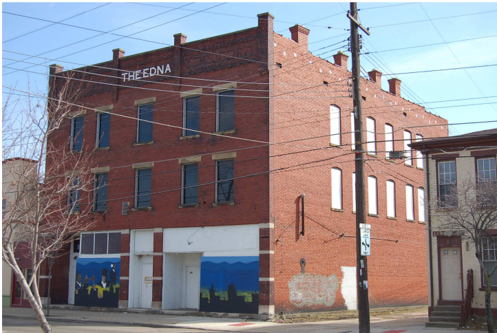
879 E. Long Street "The Edna"

Request for Proposals City Owned Real Estate