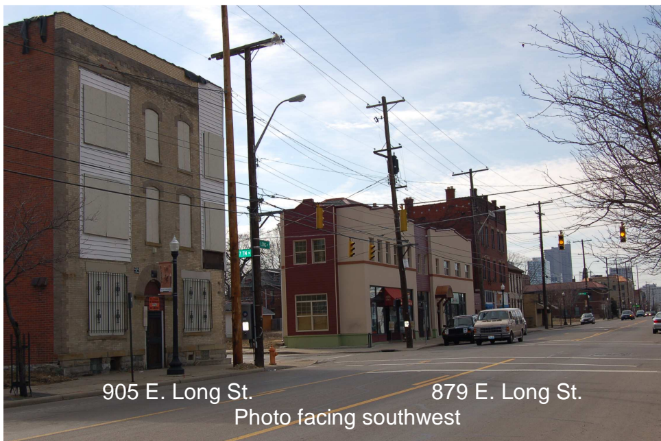
905 E. Long St.