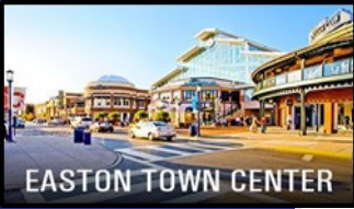
EASTON TOWN CENTER